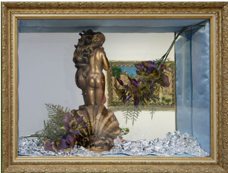
Fig.4.22 Gülsün Karamustafa (b. 1946), Gold Venus with Mirror , 1985, found object, wood, plastics, mirror, 65 × 88 cm, courtesy the Artist and Rampa Gallery, Istanbul. Photo © Thomas Bruns, Staatliche Museen zu Berlin, Nationalgalerie.

Moving on to gender concerns in the non-Western context, Turkish artist Gülsün Karamustafa produced three works featuring the Venus from Botticelli's The Birth of Venus during the 1980s. 9 The most notable of these is the 1985 assemblage, Gold Venus with Mirror (fig.4.22). It consists of a box covered with a glass panel to allow a view inside. The object thus creates a stage for something never seen before – the back side of Botticelli's The Birth of Venus – as an oblique look in the mirror covering the back wall confirms. Even if the auxiliary figures from Botticelli's original have been omitted, the shore setting is well recreated through crumbled aluminium foil and blue fabric, with the rain of roses hinted at by two large-scale artificial flowers. The most interesting part, however, is that the statuette is not the work of Karamustafa as a sculptor,