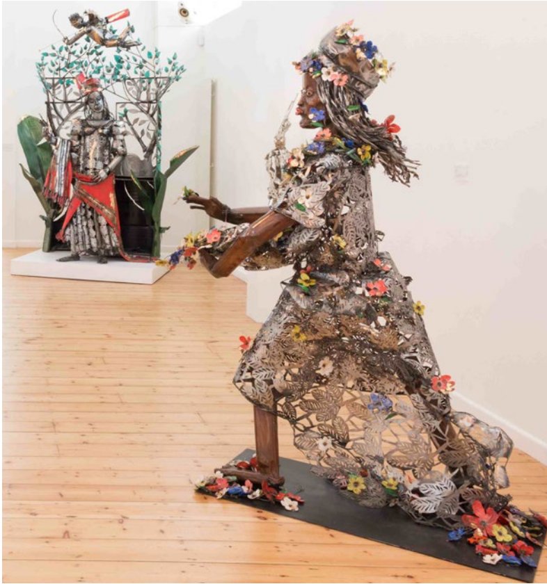
Fig.4.26 Sokari Douglas Camp (b. 1958), partial view of the work ensemble Primavera (presented at October Gallery between 7 April–14 May 2016), 2015–16, steel, gold and copper leaf, acrylic paint, various dimensions. © Courtesy of the Artist and October Gallery, London.

– the branches are coloured in two different greens: a more turquoise green for the small, almond-shaped leaves surrounding the head and a darker green at the bottom. This lower vegetation, covered by the other figures in Botticelli's painting, has been shaped by Douglas Camp in the form of large banana leaves. The metal she uses for the foliage is that of oil barrels, cut open to build the backdrop.